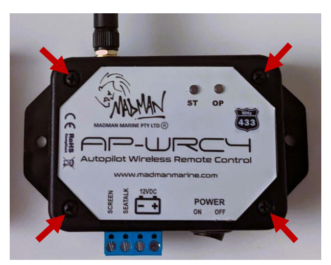
Figure 1 - Remove the 4 screws shown by the arrows.

3. Locate the white button on the small receiver circuit board which is standing up from the main circuit board on the left side (see Figure 2 for button location). The pushbutton faces the wall of the case.